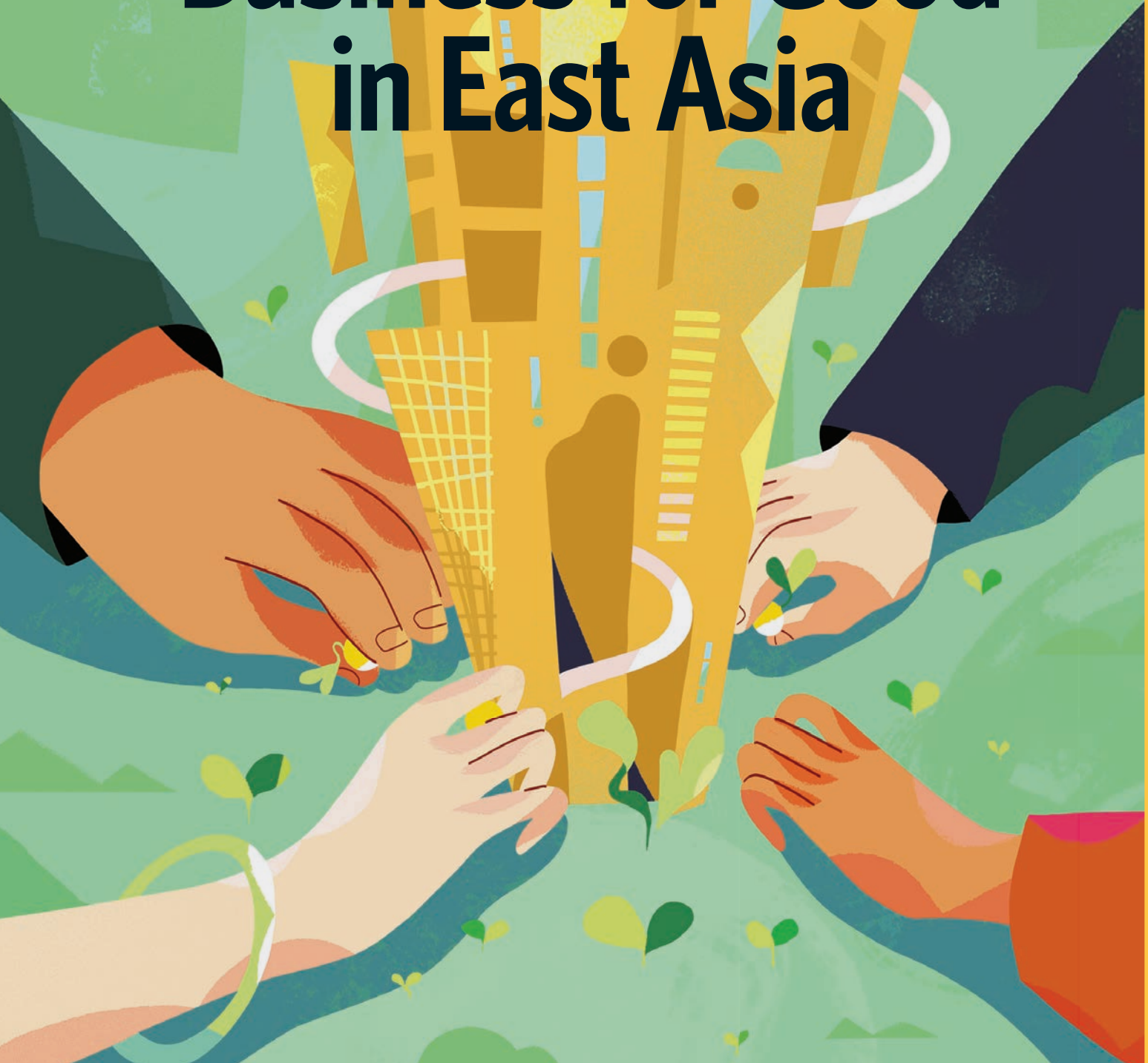
ILLUSTRATION BY KIMBERLY SALT